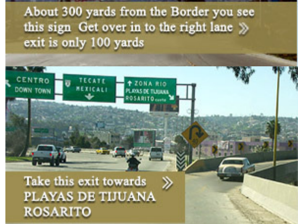
Take this exit towards >> PLAYAS DE TIJUANA ROSARITO