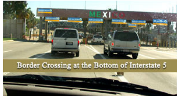
Border Crossing at the Bottom of Interstate 5

Just ahead is a toll booth, the first of a few on the way to Ensenada. The toll is approximately $2.30. Follow the toll road to Ensenada.