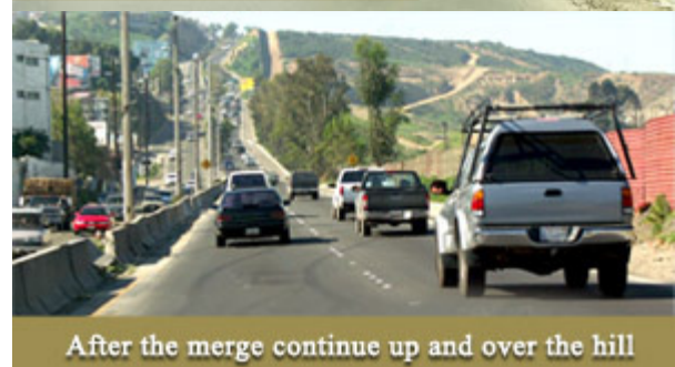
After the merge continue up and over the hill