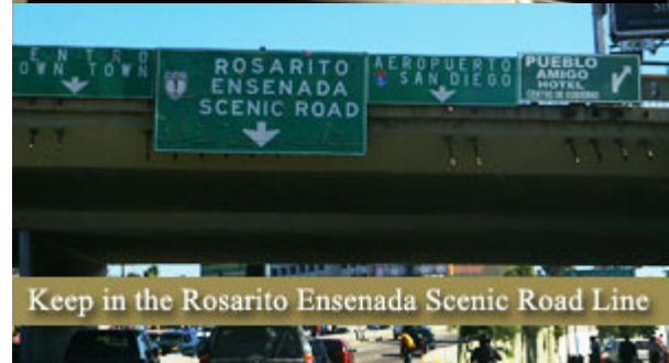
Keep in the Rosarito Ensenada Scenic Road Line